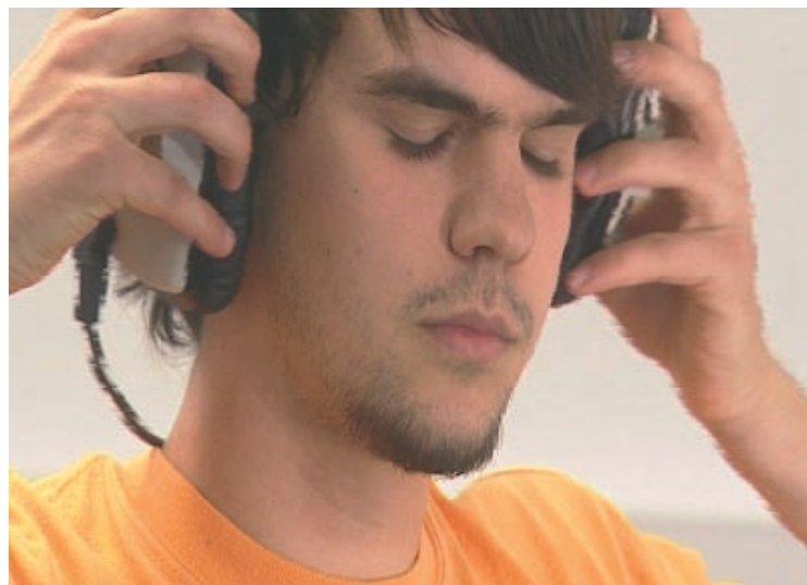
Drum Room, 2007, 15 min.

Drum Room at first resembles an architectural study of a contemporary building. Magnificent shots feature great formal geometrical interiors that are strangely empty until young rock musicians appear, learning collectively to play solo. Few moving pictures have sought to film sound... Pennell lends movement and life to the venues thanks to audio and visual echoes in the musicians' movement. Movement (the drummer's drum sticks whirling against a blue background, miming the concentrated professional) is as important as the sound created by the instrument. She underscores that what is beautiful in a musical performance is also the physical presence of the musician and his or her way of occupying the space—sound as a shape that colors silence.