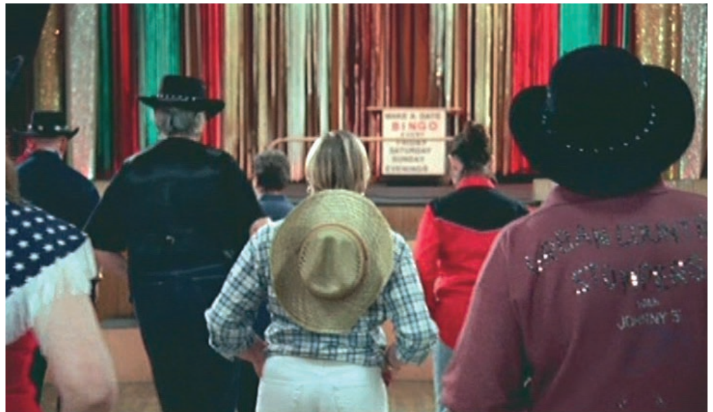
Fisticuffs , 2004, 11 min.